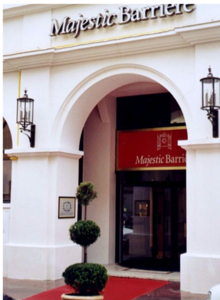
Facade of the l'Hôtel Majestic Barrière of Cannes - Etudes & Réalisations Staff